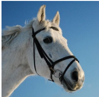
Figure 1: Nice horse

Integer sodales tincidunt tristique. Sed a metus posuere, adipiscing nunc et, viverra odio. Donec auctor molestie sem, sit amet tristique lectus hendrerit sed. Cras sodales nisl sed orci mattis iaculis. Nunc eget dolor accumsan, pharetra risus a, vestibulum mauris. Nunc vulputate lobortis mollis. Vivamus nec tellus faucibus, tempor magna nec, facilisis felis. Donec commodo enim a vehicula pellentesque. Nullam vehicula vestibulum est vel ultricies.